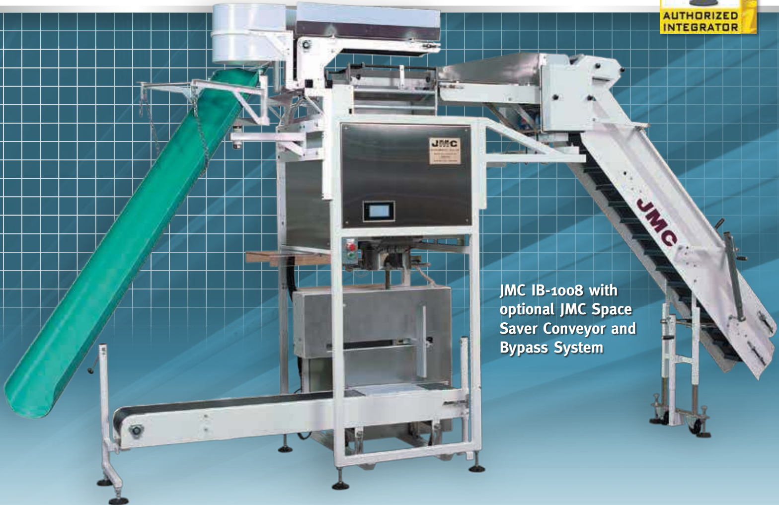
JMC IB-1008 with optional JMC Space Saver Conveyor and Bypass System

Automatic Master Baling of various types and sizes of pre-packaged ice products. Accommodates product bags with a common width and adjustable length, from all types of manual and automated packaging lines. Consider the optional JMC FuseAire 4 Hot Air Sealer for a reliable and trouble free Automatic Master Baling system.