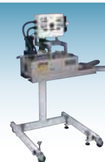
Hot Air Sealers